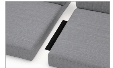
JOINT CLOTH (attached)