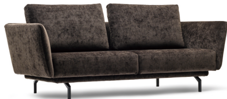
Sofa 1960 (Fabric)