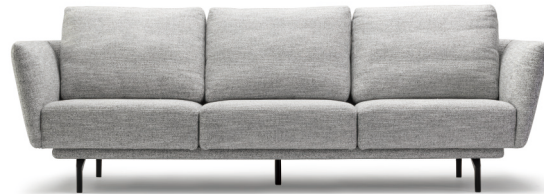
Sofa 2360 (Fabric)

The feature of this sofa is the gently rounded arms with a floating design. We are particular about the material, and have achieved high-quality seating comfort. We also have a wide variety of sizes. A dedicated headrest and tray table can be ordered for a more relaxing experience.